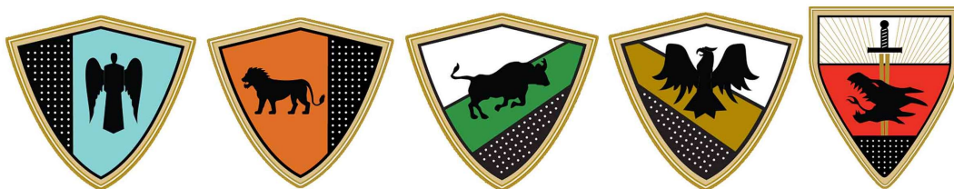
Figure 15: Junior Cadet Rank Patches

Junior Cadet Rank patches are shield-shaped patches awarded at the beginning of the program year to Junior Cadets who have completed their rank requirements from the previous year. This patch will be affixed on the left arm, centered and 1/2 inch below the Local Troop patch. Until the permanent Dragon Slayer patch is awarded, TSG suggests affixing the Junior Cadet Rank patches with Velcro.