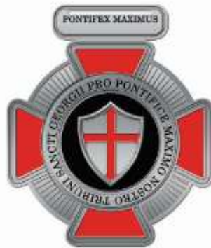
Figure 19: Tribune Medal / Patch

When the Tribune has been earned, the Tribune patch will be worn centered vertically and horizontally on the right breast pocket. See Appendix A. The Tribune medal will be worn on a ribbon in ceremonial events. This Tribune medal / patch should be requested through TSG HQ to ensure uniformity.