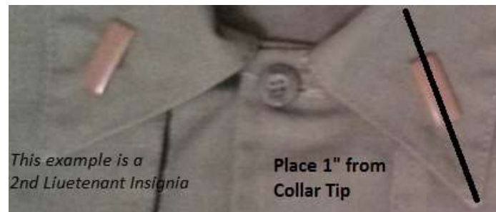
Figure 17: Example of Rank Pin Placement

As shown on page 11 of the Uniform Guidelines (Figures 5 through 11), the 1 one inch subdued rank pins based on the Senior Cadet or Adult leader's role, will be placed centered and 1 inch from the collar tip with an imaginary line drawn through the middle of the pin from the tip to the neck.