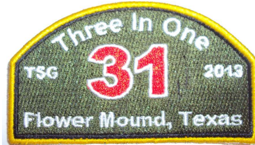
Figure 18: Example of Local Troop Patch

As your local Troop designs its Troop number patch, affix centered on the left arm and 2 inches below the shoulder to sleeve seam. As to design, the total footprint of the patch should not exceed 2 inches tall and 3 ½ inches wide, below shape and may not include a red background. See Appendix A.