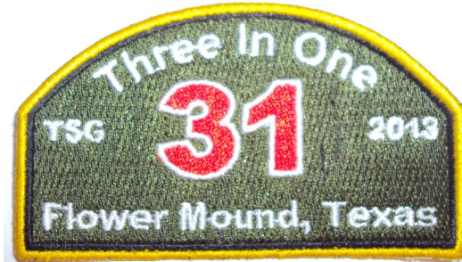
Figure 18: Example of Local Troop Patch

As your local Troop designs its Troop number patch, affix centered on the left arm and 2 inches below the shoulder to sleeve seam. As to design, the total footprint of the patch should not exceed 2 inches tall and 3 ½ inches wide, below shape and may not include a red background. See Appendix A.