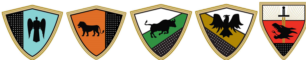
Figure 15: Junior Cadet Rank Patches

Junior Cadet Rank patches are shield-shaped patches awarded at the beginning of the program year to Junior Cadets who have completed their rank requirements from the previous year. This patch will be affixed on the left arm, centered and 1/2 inch below the Local Troop patch. Until the permanent Dragon Slayer patch is awarded, TSG suggests affixing the Junior Cadet Rank patches with Velcro.