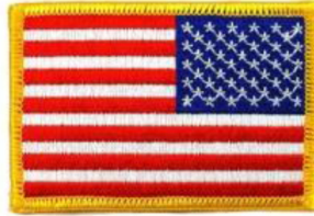
Figure 13: National Flag Example

The flag of the nation is affixed to the right arm of the uniform, centered and 2 inches below the shoulder to sleeve seam. Your country's flag should not be muted, subdued or camouflaged. In absence of local law or custom, the flag should be in "advancing" format, so that it appears as though it is being carried forward (i.e. for the U.S. Flag, the star field should be in the upper right hand corner).