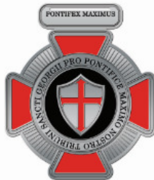
Figure 19: Tribune Medal / Patch

When the Tribune has been earned, the Tribune patch will be worn centered vertically and horizontally on the right breast pocket. See Appendix A. The Tribune medal will be worn on a ribbon in ceremonial events. This Tribune medal / patch should be requested through TSG HQ to ensure uniformity.