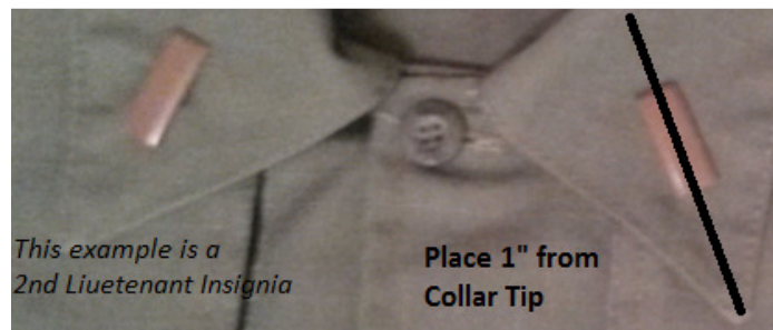
Figure 17: Example of Rank Pin Placement

As shown on page 11 of the Uniform Guidelines (Figures 5 through 11), the 1 one inch subdued rank pins based on the Senior Cadet or Adult leader's role, will be placed centered and 1 inch from the collar tip with an imaginary line drawn through the middle of the pin from the tip to the neck.