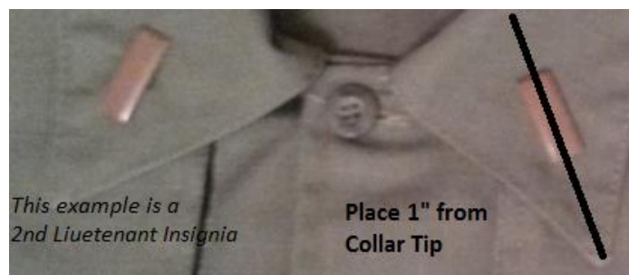
Figure 17: Example of Rank Pin Placement

As shown on page 11 of the Uniform Guidelines (Figures 5 through 12), the 1 one inch subdued rank pins based on the Senior Cadet or Adult leader's role, will be placed centered and 1 inch from the collar tip with an imaginary line drawn through the middle of the pin from the tip to the neck.