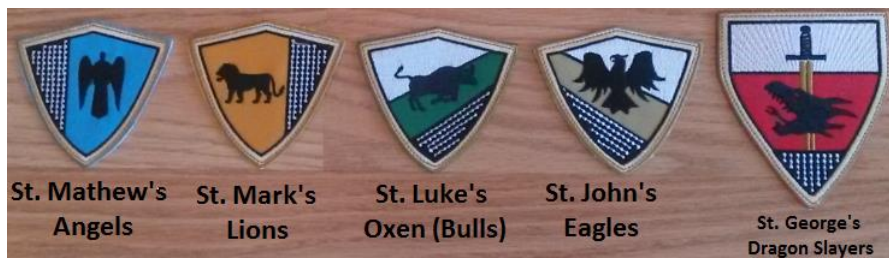
Figure 15: Junior Cadet Rank Patches

Junior Cadet Rank patches are shield-shaped patches awarded at the end of the program year to Junior Cadets who have completed their rank requirements for that year. Until the permanent Dragon Slayer patch is awarded, TSG suggests affixing the Junior Cadet Rank patches with Velcro. To leave room above for the Achievement Course Stars, affix the JC Rank patches centered on the left arm and 1 inch below the local Troop patch. Until the Dragon Slayer patch is secured, Velcro is recommended for these.