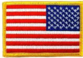
Figure 13: National Flag Example

The flag of the nation is affixed to the right arm of the uniform, centered and 2 inches below the shoulder to sleeve seam. Your country's flag should not be muted, subdued or camouflage. In absence of local law or custom, the flag should be in "advancing" format, so that it appears as though it is being carried forward (i.e. for the U.S. Flag, the star field should be in the upper right hand corner).