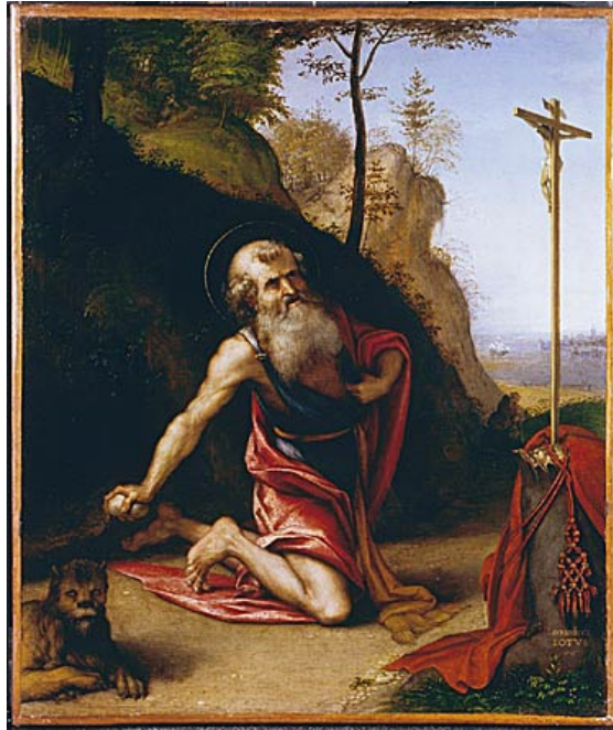
St. Jerome, pray for us!

St. Jerome was born around the year 342 in Dalmatia and was brought up in the Christian Faith. St. Jerome was sent to Rome at an early age and quickly became a scholar. He learned to speak both Latin and Greek languages. While in Rome and surrounded by pagans he struggled to hold close to the Christian Faith. Although, in 360 he was baptized by Pope Liberius. After his baptism his faith continued to deepen with studies and over the time spent with the monks in Antioch. Pope Damasus turned to him for counsel and dealings concerning the Antioch schism. While in Bethlehem, he undertook the difficult and laborious task of translating most of the Old Testament from Hebrew into Latin. This translation set into motion the pathway for the Vulgate, which is the Catholic Church's Latin version of the Old Testament. He is one of the Catholic Doctors of the Church for defending the Divine Word and is the patron saint of librarians and translators.