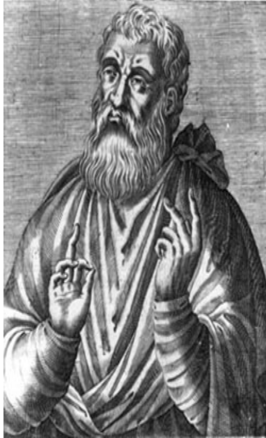
St. Justin Martyr, pray for us!

St. Justin Martyr is the patron saint of Catholic apologists. He was born at the beginning of the second century and studied pagan philosophy. He turned to Christianity after finding the source of Truth, which the pagans weren't able to explain. He was astounded by the zeal and love shown by the Christian martyrs and converted to Christianity. He opened a school in Rome to teach Greek philosophy through the lens of Christianity. As an apologist, he wrote on defending the Christian Faith. He was martyred for the Faith around 165 by Emperor Marcus Aurelius.