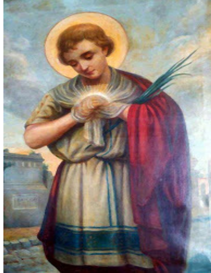
St. Tarcisius, pray for us!

St. Tarcisius was a 12 year old acolyte, possibly of the pope, in the 3 rd century during a harsh Roman persecution. Mass was secretly held in the catacombs for fear of imprisonment. A deacon would make a clandestine visit to the prisons and bring the Holy Eucharist to the Christian prisoners. One day, there was no deacon, and as an acolyte, St. Tarcisius desired to bring the Holy Eucharist to them. Although, when he was en route, a group of unruly non-Christian children wanted to know what he was doing. He did not want to play their games and they began to taunt him. They discovered he was hiding something, and began to beat him to see what he was hiding. Christians came to his aid, but his injuries were too severe. He died protecting our Lord and Savior, Jesus Christ, in the Holy Eucharist.