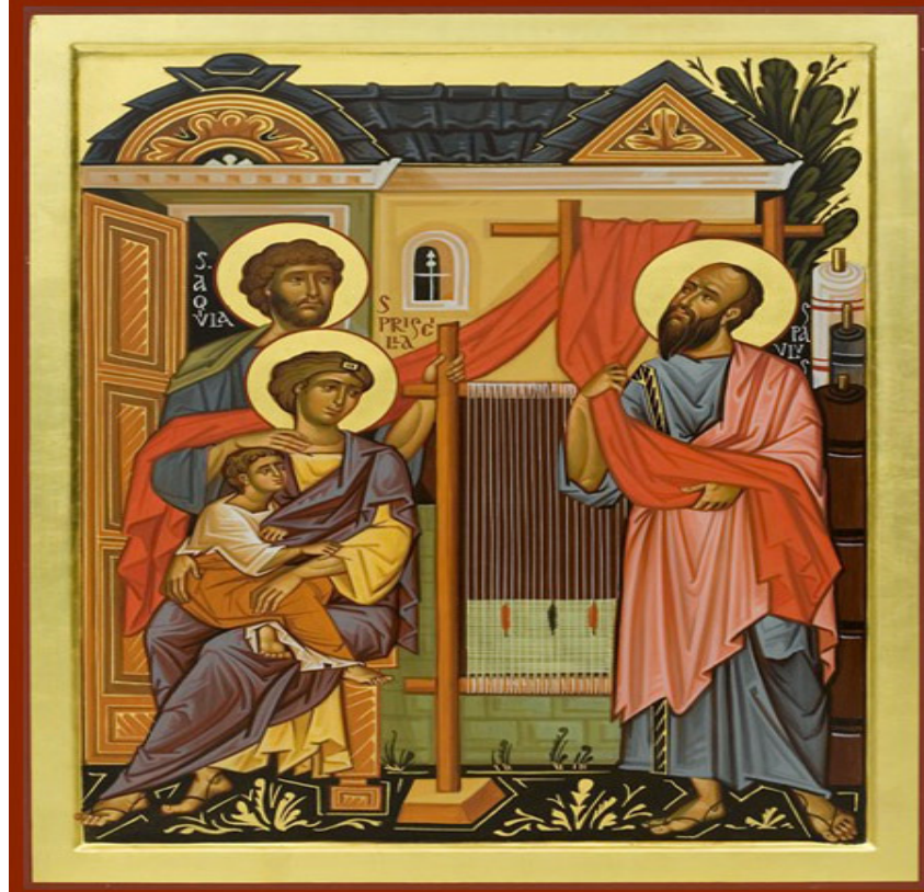
St. Paul, pray for us!

St. Paul is the patron saint of tent makers. Acts 18:3 states that Paul went to Corinth and “went to visit them and, because he practiced the same trade, stayed with them and worked, for they were tentmakers by trade.” Camping during biblical times was very commonplace. In Exodus, we find the Israelites following the cloud by day and fire at night. When either one stopped moving they were to set up camp. Also, in Hebrews 11:9 we find that Abraham “sojourned in the promised land as in a foreign country, dwelling in tents with Isaac and Jacob.”