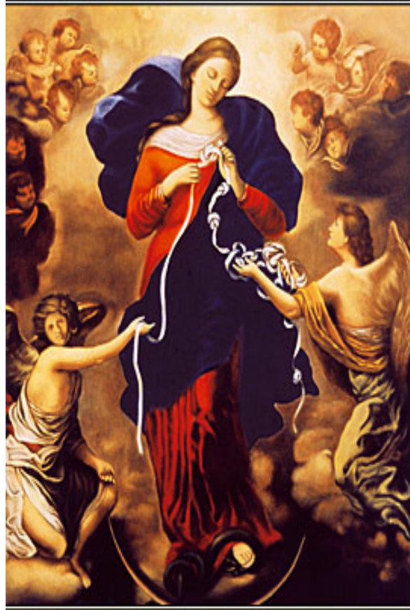
Mary, Undoer of Knots, Pray for us!

In the 2 nd century the bishop of Lyon, Saint Irenaeus, made the comparison of Eve and the Blessed Virgin Mary. He said, “the knot of Eve’s disobedience was loosed by the obedience of Mary. For what the virgin Eve had bound fast through unbelief, this did the virgin Mary set free through faith.” ( Adversus haereses , 3, 22) These knots are the many problems/sins that we face or bring upon ourselves during our lives. Pope Francis has a great devotion to Our Lady and encourages our devotion too.