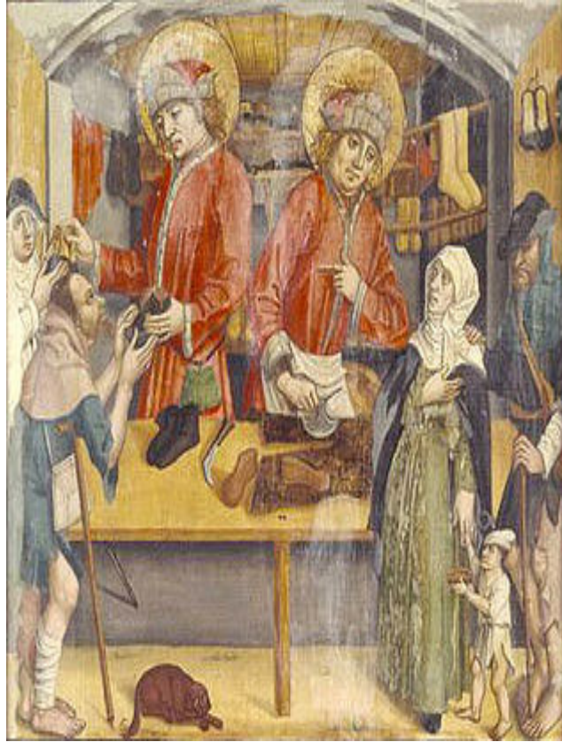
Saints Crispin and Crispinian, pray for us!

Saints Crispin and Crispinian are the patron saints of leather work and cobblers. They preached by day and made shoes and leather items by night to support themselves. They were martyred in the third century and their feast was immortalized by William Shakespeare's Saint Crispin Day speech in his play "Henry V".