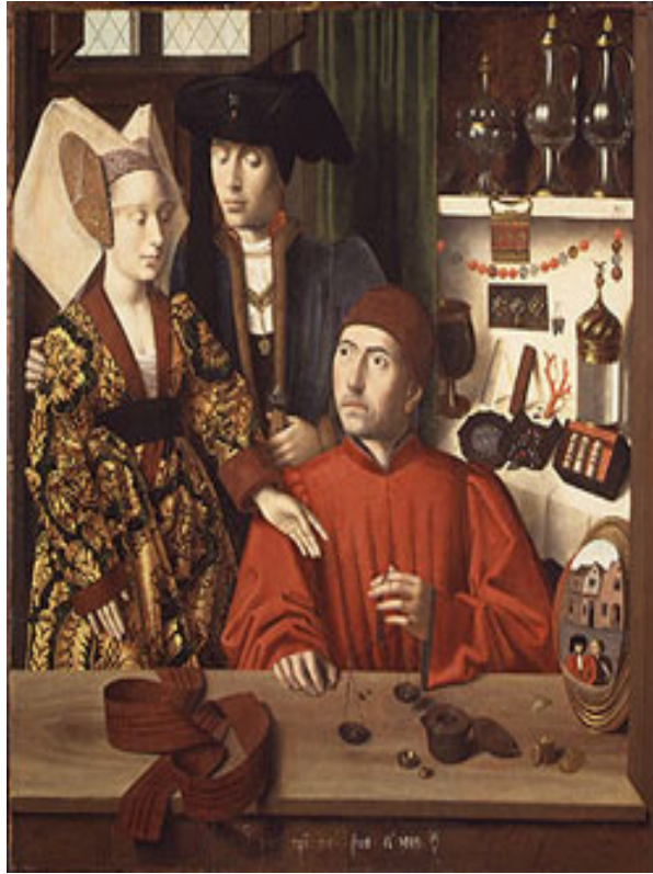
St. Eligius, pray for us!

St. Eligius is the patron saint of mechanics. He was born near Limoges, France around 590. He was a prominent metalsmith and was the master of the mint under the king. He was very generous with his wealth by ransoming slaves, aiding the poor, building churches, a monastery, and a convent. When he was about 50 years of age, he became a priest and then a bishop. He helped many people to know God and many people converted to the Christian faith. Early in his life as a metalsmith, he helped many people with his wealth and through his vocation as priest he led many people to our dear Lord and Savior, Jesus Christ.