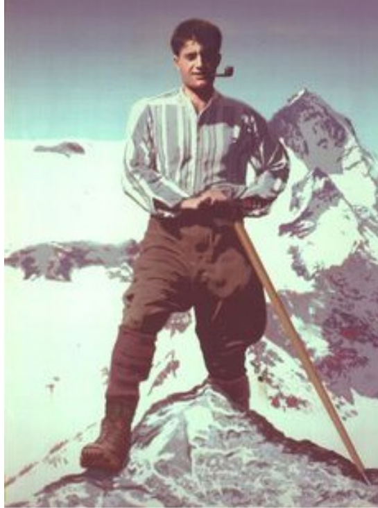
Blessed Frassati, pray for us!

Blessed Pier Giorgio Frassati was a young man from an influential family in Italy who lived and died in the first quarter of the 20 th century. He climbed mountains, smoked cigars, had fist fights to protect his family and he knew the value of money. In fact he maintained a ledger of income and expenses because he was serious about being responsible with his money so he could relieve suffering in his community. And he did! When Pier Giorgio died from polio at age 24; his family, had no real idea of how he had dedicated himself to the poor. They were overwhelmed by the many thousands of people who turned out to mourn his passing. Money can be a tool to be used for great good if you learn the basic principles set forth in this Achievement Course. “If you have God as the center of all your action, then you will reach the goal”... Blessed Pier Giorgio Frassati.