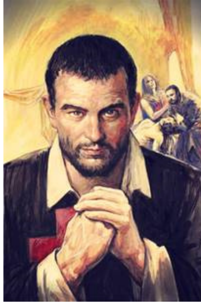
Saint Camillus, pray for us!

The First Aid Achievement Course patron saint is Saint Camillus de Lellis, who with his father, was a soldier of fortune and an adventurer of sorts. Saint Camillus watched his father return to the sacraments after many years on his death bed and this made Saint Camillus want to return to his Catholic Faith. After many struggles in ridding himself of the bad habits he picked up in his life of being a soldier of fortune, he was able to serve others by providing medical attention rooted in the Love of God. But it was not enough for Saint Camillus to simply provide for the physical wellbeing of his patients, he wanted to also provide for their eternal wellbeing! Saint Camillus was ordained to the holy priesthood and founded an order called the Fathers and Brothers of a Happy Death. Saint Camillus was given permission for he and his brethren to wear the Red Cross and they were the first ones to go onto the battlefield. They tended to the spiritual and physical needs of the wounded wearing the Red Cross, which is now the international symbol of medical personnel.