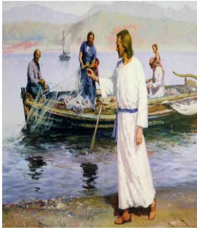
Sts. Peter and Andrew, pray for us!

The Patron Saints of fishermen are Saint Peter and Saint Andrew, who were both fishermen. St. Andrew was St. Peter's brother, and was called with him. "As Jesus was walking by the Sea of Galilee, he saw two brothers, Simon who is now called Peter, and his brother Andrew, casting a net into the sea; they were fishermen. He said to them, 'Come after me, and I will make you fishers of men.' At once they left their nets and followed him" (Matthew 4:18-20). St. John the Evangelist presents Andrew as a disciple of John the Baptist. When Jesus walked by one day, John said, "Behold, the Lamb of God." Andrew and another disciple followed Jesus. "Jesus turned and saw them following him and said to them, 'What are you looking for?' They said to him, 'Rabbi (which translated means Teacher), where are you staying?' He said to them, 'Come, and you will see.' So they went and saw where he was staying, and they stayed with him that day" (John 1:38-39a).