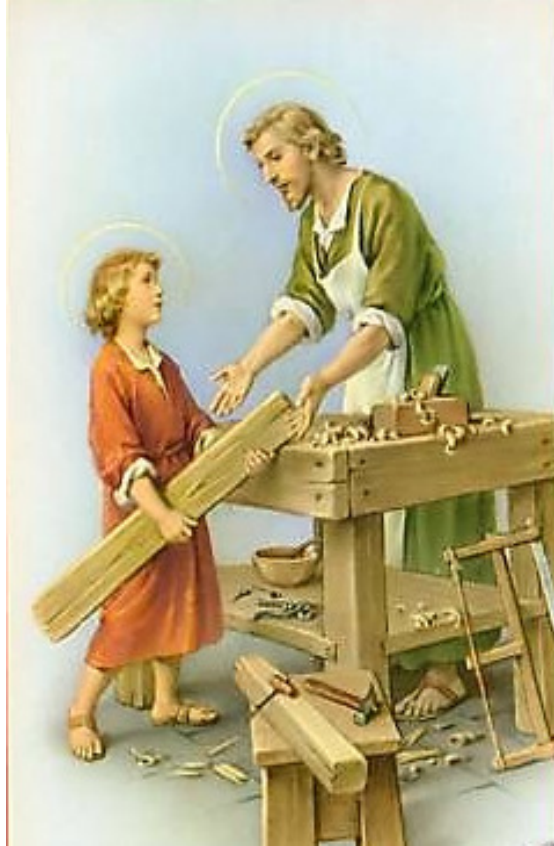
St. Joseph, pray for us.

Handiwork is the basic understanding of proper tool use in the work of craftsmanship or repairing things by hand as applied to plumbing, electricity, automotive, appliances, and wood. Throughout history man has been using his hands to build or repair things around home and work, from Adam to Noah to Joseph and Jesus to the present day. St. Joseph and Jesus, as carpenters, used their hands to carve and build things out of wood for their home and for others.