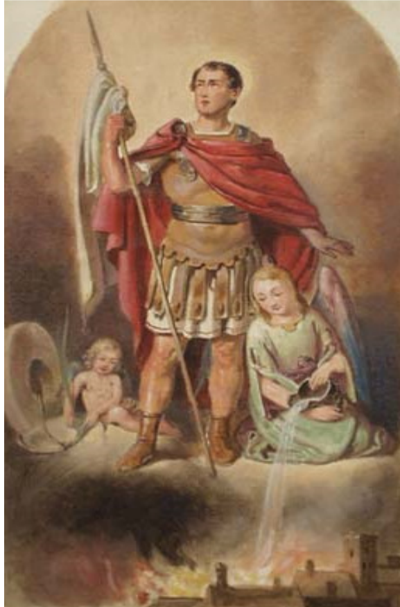
St. Florian, pray for us!

St. Florian lived in the 3 rd century in what is now known as Austria. He was a Roman officer during the Diocletianic Persecution when many Christians were murdered. After holding strong to his Christian Faith he gave himself up to the governor, Aquilinus, when the Christians were being executed. He was scourged, half-flayed, set afire, and then drowned in the River Enns. He is the patron saint of firefighters. There are firefighter and first responder prayer groups in the U.S.A. that look to St. Florian for his intercession during their difficult times.