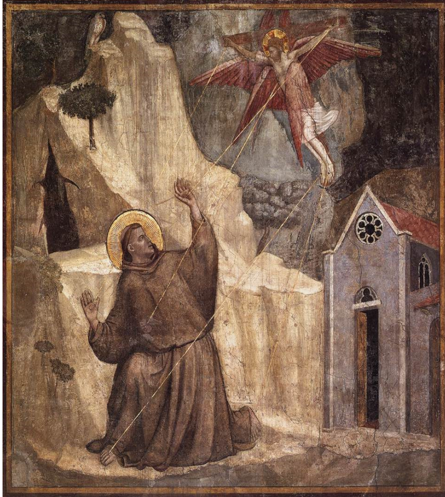
St. Francis, pray for us!

In 1979 St. Pope John Paul II named St. Francis of Assisi the patron saint “of those who promote ecology.” St. Francis often prayed outside and lived in various hermitages, caves, lean-tos, and mountainsides. He had a great affinity towards God’s creation including the land, animals, birds, fish, and people. One day while praying in the Chapel of San Damiano he heard a clear voice from the crucifix say “Francis, go and repair My Church, which you can see has fallen into ruin.” He started to fix the physical church, only to realize that he was supposed to help repair God’s entire church family. He preached all over the land and was given the precious gift of the stigmata which showed the wounds from Christ’s passion.