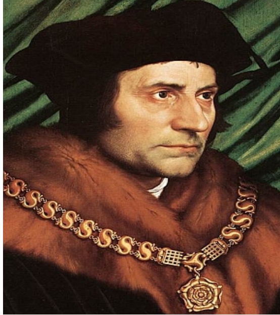
Saint Thomas More, pray for us!

Saint Thomas More was born in 1478 in London, England. Thomas' father provided him a solid Catholic education and at the age of 13, placed him in the home of the Archbishop of Canterbury's home for further training. Saint Thomas studied law at Oxford and after discerning his vocation, had a brilliant and successful career, married and had 4 children. Saint Thomas eventually became the secretary and personal advisor to King Henry VIII, who appointed him as Lord Chancellor of England in 1529.