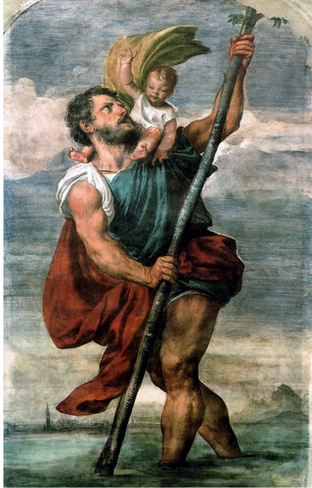
St. Christopher, pray for us!

St. Christopher lived during the 3 rd century. He was a martyr that died for his Christian Faith. There are legends about him concerning his great strength and faithfulness. One legend states that a child needed to cross a river and wanted St. Christopher's help. When St. Christopher picked up the child he noticed that the child felt a lot heavier than expected. When St. Christopher looked up at the child on his shoulders he noticed that it was the Child Jesus with the weight of the world on His shoulders. St. Christopher is the patron saint of travelers, he is invoked against storms, and plagues.