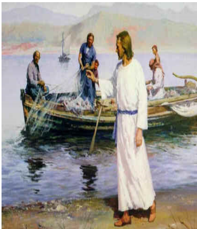
Sts. Peter and Andrew, pray for us!

The Patron Saints of fishermen are Saint Peter and Saint Andrew, who were both fishermen. St. Andrew was St. Peter's brother, and was called with him. "As Jesus was walking by the Sea of Galilee, he saw two brothers, Simon who is now called Peter, and his brother Andrew, casting a net into the sea; they were fishermen. He said to them, 'Come after me, and I will make you fishers of men.' At once they left their nets and followed him" (Matthew 4:18-20). St. John the Evangelist presents Andrew as a disciple of John the Baptist. When Jesus walked by one day, John said, "Behold, the Lamb of God." Andrew and another disciple followed Jesus. "Jesus turned and saw them following him and said to them, 'What are you looking for?' They said to him, 'Rabbi (which translated means Teacher), where are you staying?' He said to them, 'Come, and you will see.' So they went and saw where he was staying, and they stayed with him that day" (John 1:38-39a).