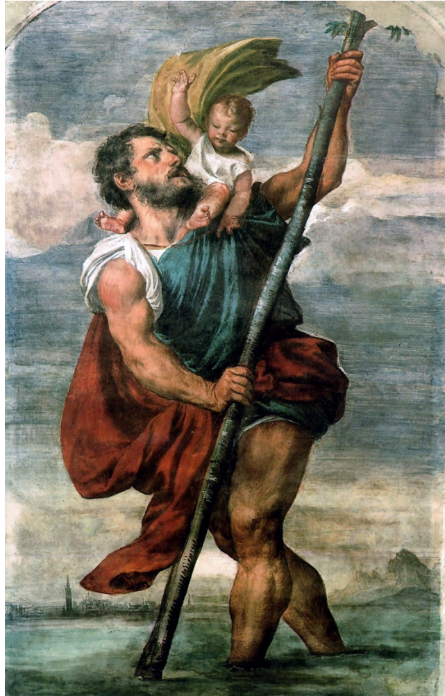
St. Christopher, pray for us!

St. Christopher lived during the 3 rd century. He was a martyr that died for his Christian Faith. There are legends about him concerning his great strength and faithfulness. One legend states that a child needed to cross a river and wanted St. Christopher's help. When St. Christopher picked up the child he noticed that the child felt a lot heavier than expected. When St. Christopher looked up at the child on his shoulders he noticed that it was the Child Jesus with the weight of the world on His shoulders. St. Christopher is the patron saint of travelers, he is invoked against storms, and plagues.