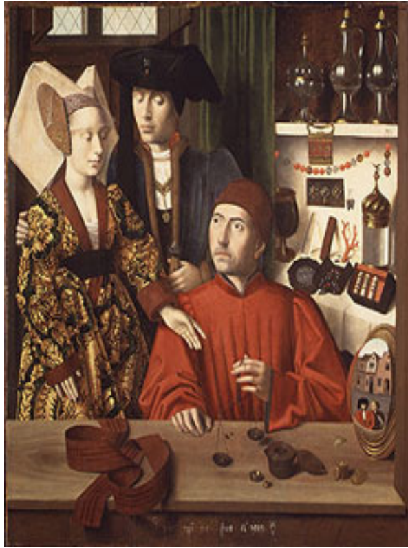
St. Eligius, pray for us!

St. Eligius is the patron saint of mechanics. He was born near Limoges, France around 590. He was a prominent metalsmith and was the master of the mint under the king. He was very generous with his wealth by ransoming slaves, aiding the poor, building churches, a monastery, and a convent. When he was about 50 years of age, he became a priest and then a bishop. He helped many people to know God and many people converted to the Christian faith. Early in his life as a metalsmith, he helped many people with his wealth and through his vocation as priest he led many people to our dear Lord and Savior, Jesus Christ.