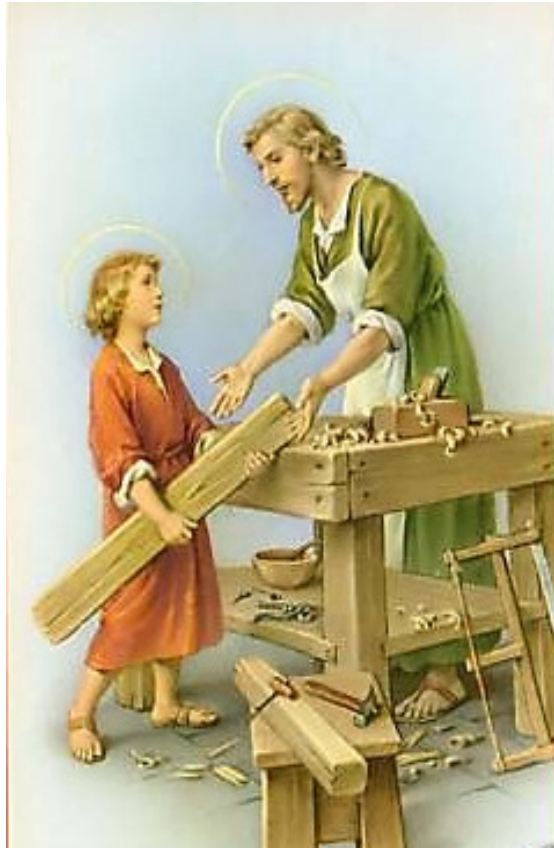
St. Joseph, pray for us.

Handiwork is the basic understanding of proper tool use in the work of craftsmanship or repairing things by hand as applied to plumbing, electricity, automotive, appliances, and wood. Throughout history man has been using his hands to build or repair things around home and work, from Adam to Noah to Joseph and Jesus to the present day. St. Joseph and Jesus, as carpenters, used their hands to carve and build things out of wood for their home and for others.